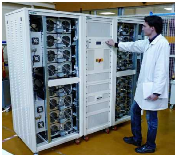
Figure 1. Prana amplifier GN 12000

The GN 12000 design is modular and modern (figure 1). It is composed of 16 identical power modules, 4 intermediate combiners, 1 final combiner and 1 coupler. The GN 12000 was designed for minimal maintenance: easy accessibility of all sub systems and all the modules can be changed each other. This design allows a fast and efficient after sales service in the world.